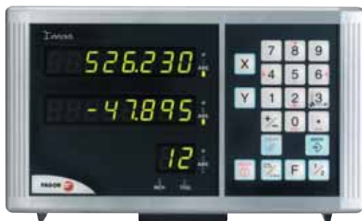
Innova 20i M