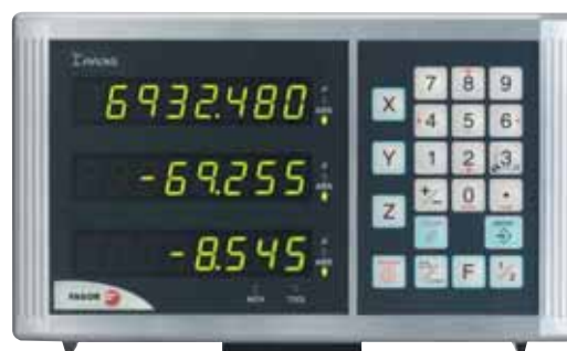
Innova 30i M